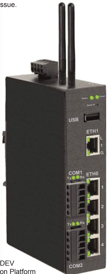
EIAP5G-DEV Automation Platform

Providing hardened circuitry and solid construction, the Automation Platform is a reliable solution for the most rugged automation systems and with its support of up to 128GB microSD cards, Flash space will never be an issue.